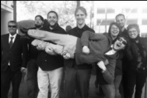
The PayPal 14

→ Neglecting solidarity with our own kind